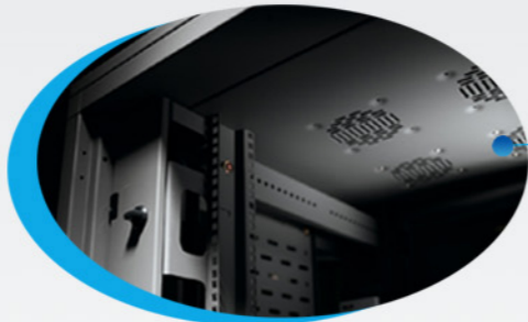
Fan top with Fan

Now, building a server room is simpler and more cost-effective. A body constructed from sturdy sheet metal and fully alloy joints, the COM-RACK CKD 218 offers unsurpassed stability and long-lasting quality.