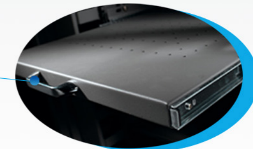
HD Sliding tray