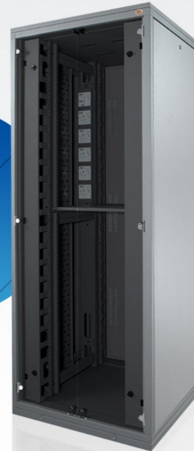
19" Equipment Rack with Cable Management panel (CKD 218)