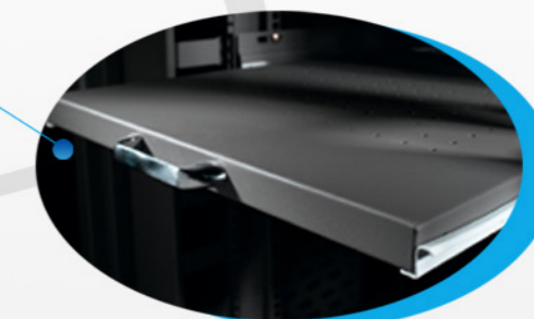
Sliding Keyboard tray