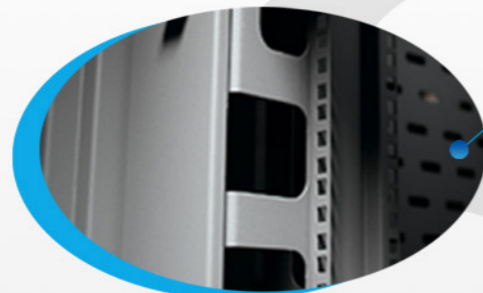
4 angle Side Vertical Cable Management Panel