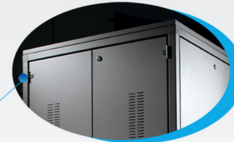
Twin Metal rear door