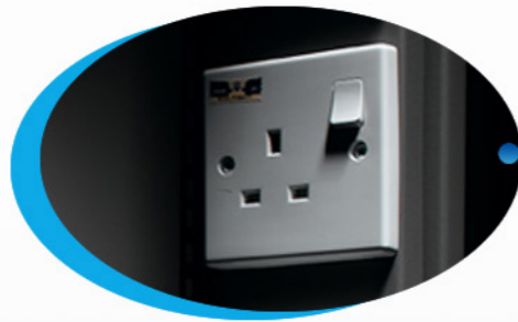
Power Point Strip