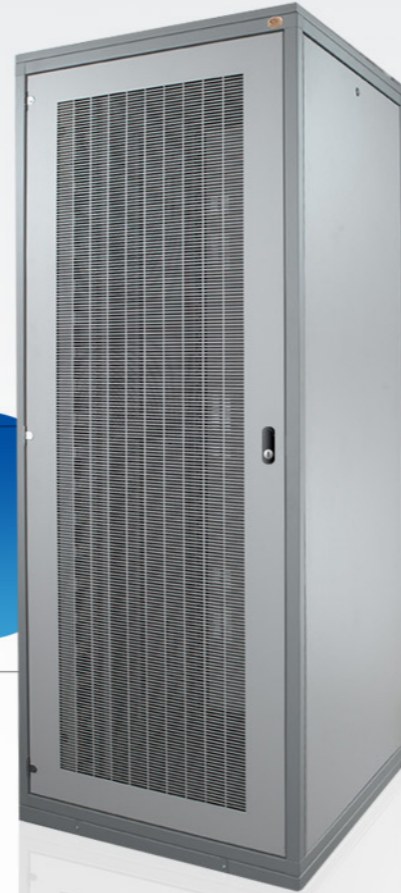
Server Rack c/w Perforated door